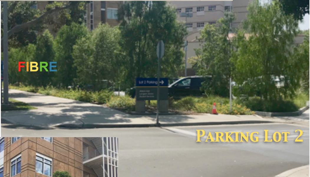
PARKING LOT 2