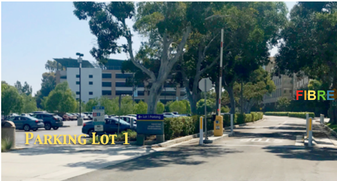
PARKING LOT 1